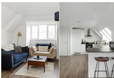
Purley Hill, CR8

Approximate Gross Internal Area 73.5 sq m / 791 sq ft